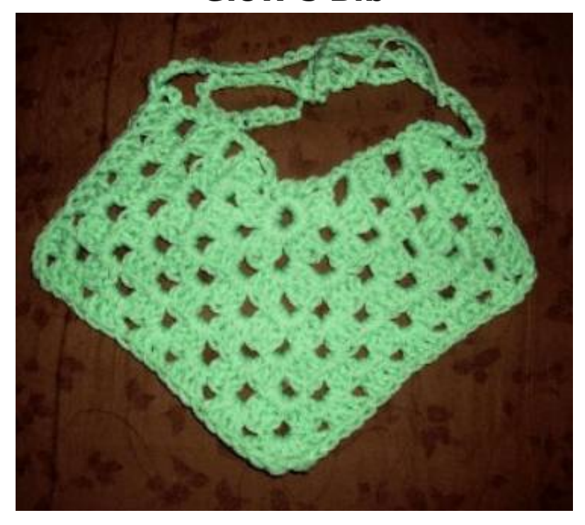
Thanx to Royce for helping me to make my pattern instructions presentable.